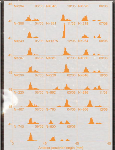
Fig. 4: Monthly length-frequency distribution of D. hanleyanus collected at “Faro Querandi” from March 2005 to December 2006.