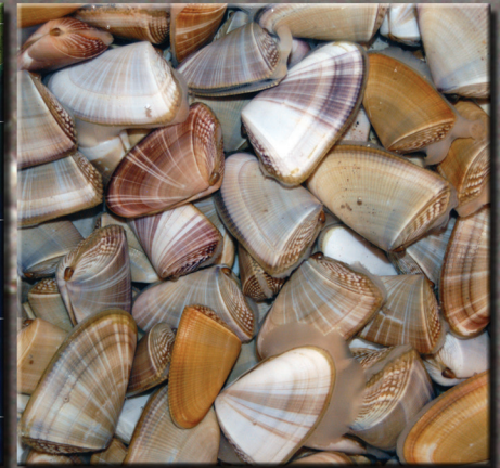
Fig. 2: Alive sampled D. hanleyanus .