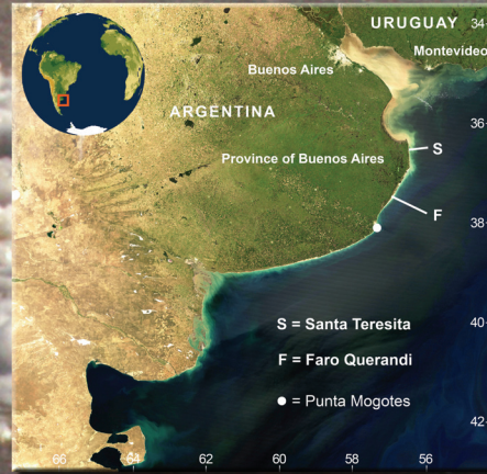
Fig. 1: Map of the study sites “Santa Teresita” and “Faro Querandi”. Punta Mogotes is the southernmost distribution for D. hanleyanus .

The population structure of D. hanleyanus was studied monthly at the dissipative, anthropogenically affected sandy beach “Santa Teresita” (36°32’S, 56°41’W) from December 2004 to December 2006 and at an exposed, nature protected sandy beach “Faro Querandi” (37°29’S, 57°07’W) from March 2005 until December 2006. Quantitative samples to determine abundances and growth parameters were taken from a series of stations (4m intervals) along a transect perpendicular to the shoreline from the spring tide high water mark to the low tide water mark. At each station, three replicates were taken to 35cm depth with a 0.16m 2 corer. The sand was sieved on a 1mm mesh. Maximum anterior-posterior length shell of each individual was measured to the lower 0.1mm with vernier callipers to obtain monthly length-frequency distributions.