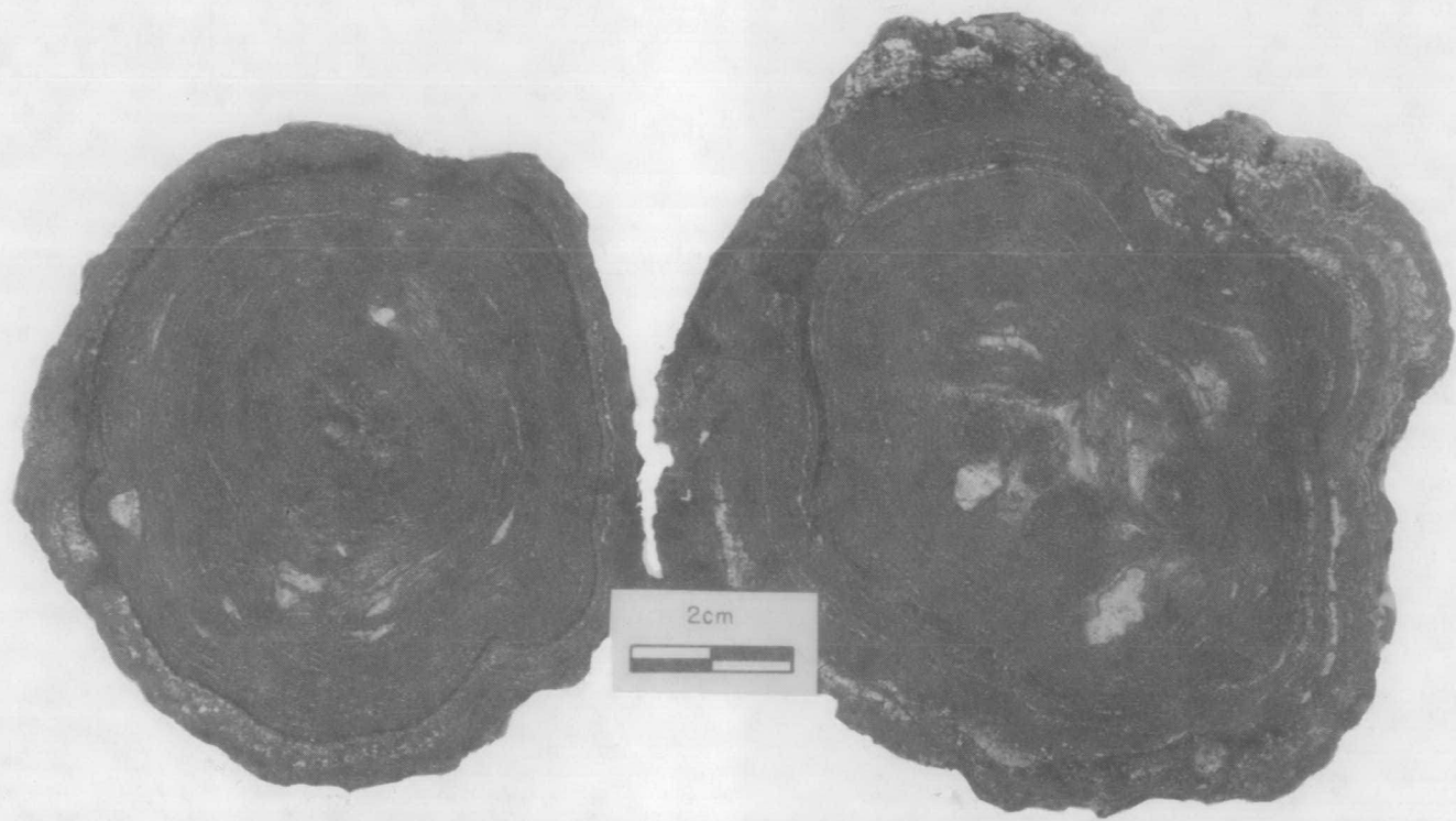
Fig. 2. Cross-section through nodules from Station 5.