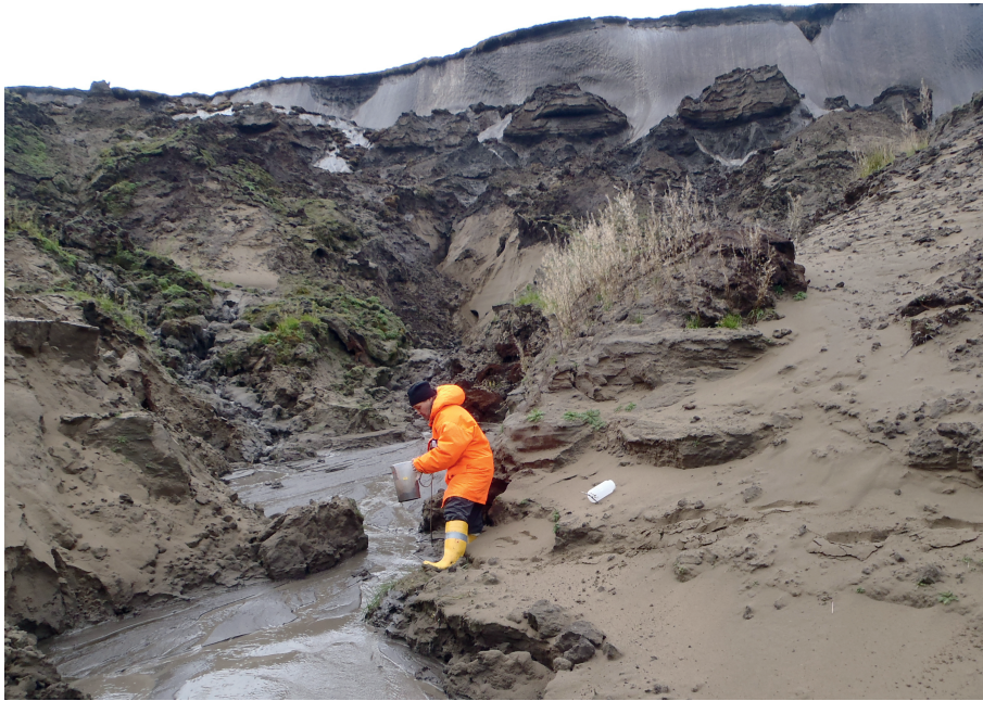
Fig. 2: Regular water sampling of meltwater from the Yedoma cliffs in the Lena Delta in late summer 2014 during maximum of ground-ice thaw and run-off of melt waters. Water samples will be analysed for dissolved organic carbon (DOC), coloured dissolved organic matter (cDOM), water isotopes (hydrogen and oxygen) and anorganic hydrochemistry (cations and anions).