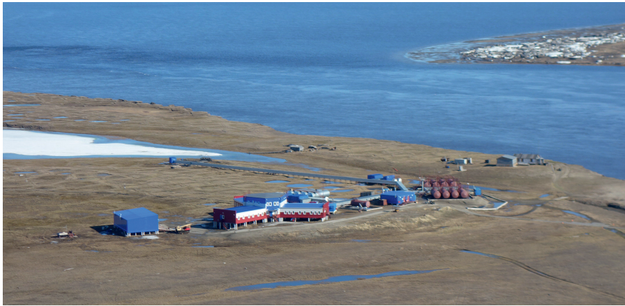
Fig. 1: Approaching the Russian research station Samoylov on Samoylov Island, Lena River Delta by helicopter. “Samoylov Station” is the logistic base for permafrost research in the Laptev Sea Region, operated by the Trofimuk Institute for Petroleum Geology and Geophysics, Siberian Branch, Russian Academy of Sciences.