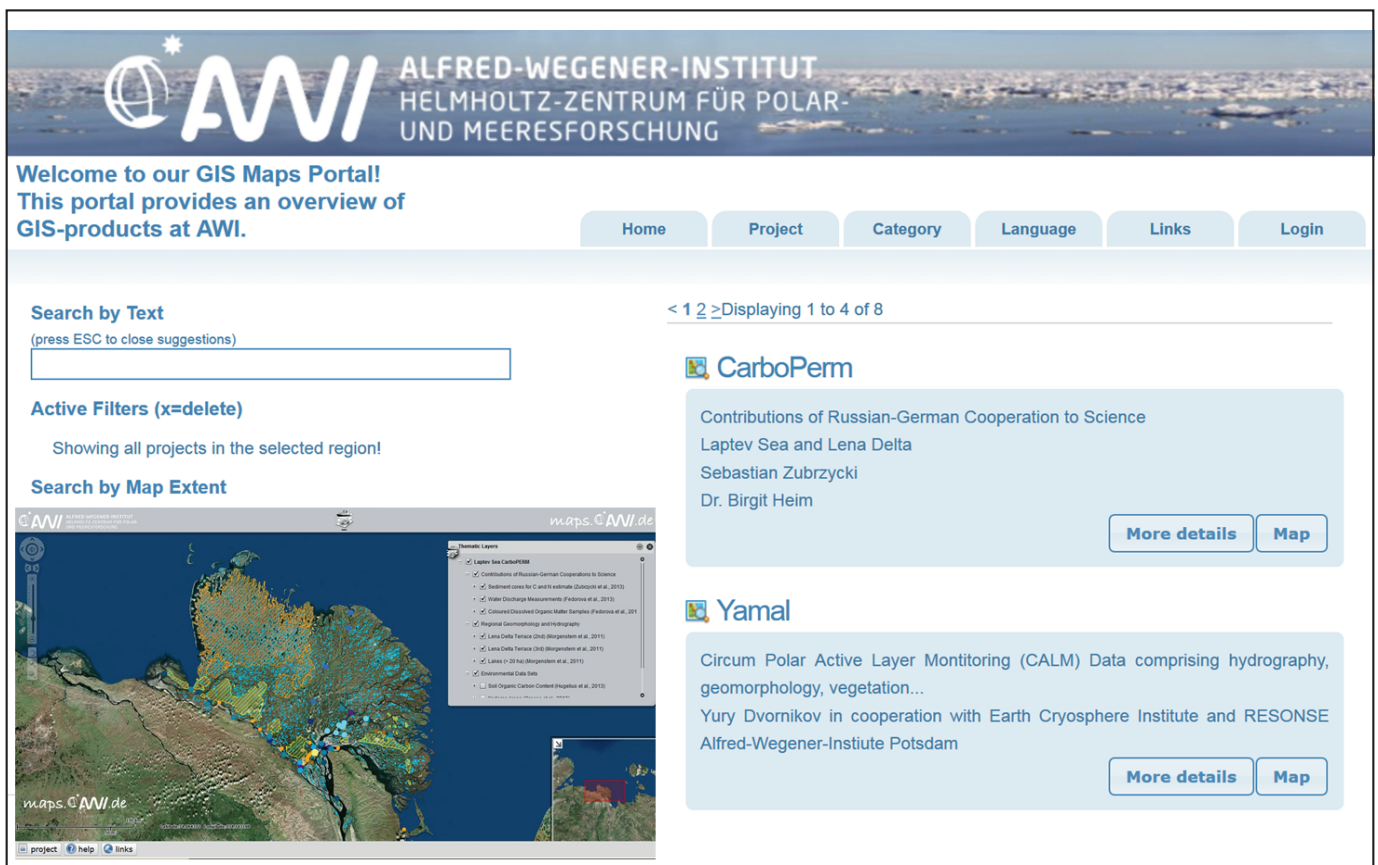
Fig. 4: “Maps@awi” – Web access to all AWI WebGIS projects including CarboPerm and Yamal WebGIS projects.

Within the CarboPerm WebGIS data assembly activities, AWI is currently assessing the usability of various openly accessible datasets whose thematic content is reliable and usable, since they are reviewed by our user communities or have even been produced by collaborating research teams. GROSSE et al. (2013) mapped the Yedoma areas and HUGELIUES et al. (2013) compiled the Circum-Arctic map of organic soil content. MORGENSTERN et al. (2011) derived the lake water objects of the Lena Delta and mapped in cooperation with Russian scientists the extent of the Lena Delta terraces. Bringing these already published data together within a broader spatial and thematic context provides an added-value to the interdisciplinary scientific communities. However, data visualisation and compilation sometimes exposes artefacts and inconformi-