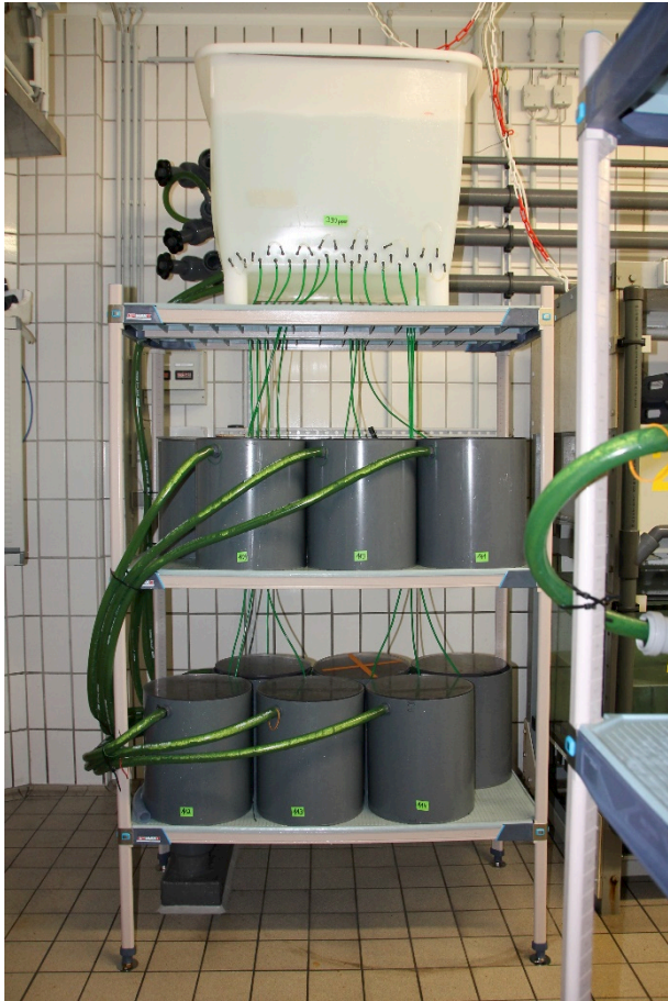
Figure S1: Representative incubation system of one treatment group with 12 animals. Each grey tank contains a single individual. Water supply is given from one header tank (white container on top) for each treatment group, in which water is pre-gassed in accordance to the respective CO 2 treatment.