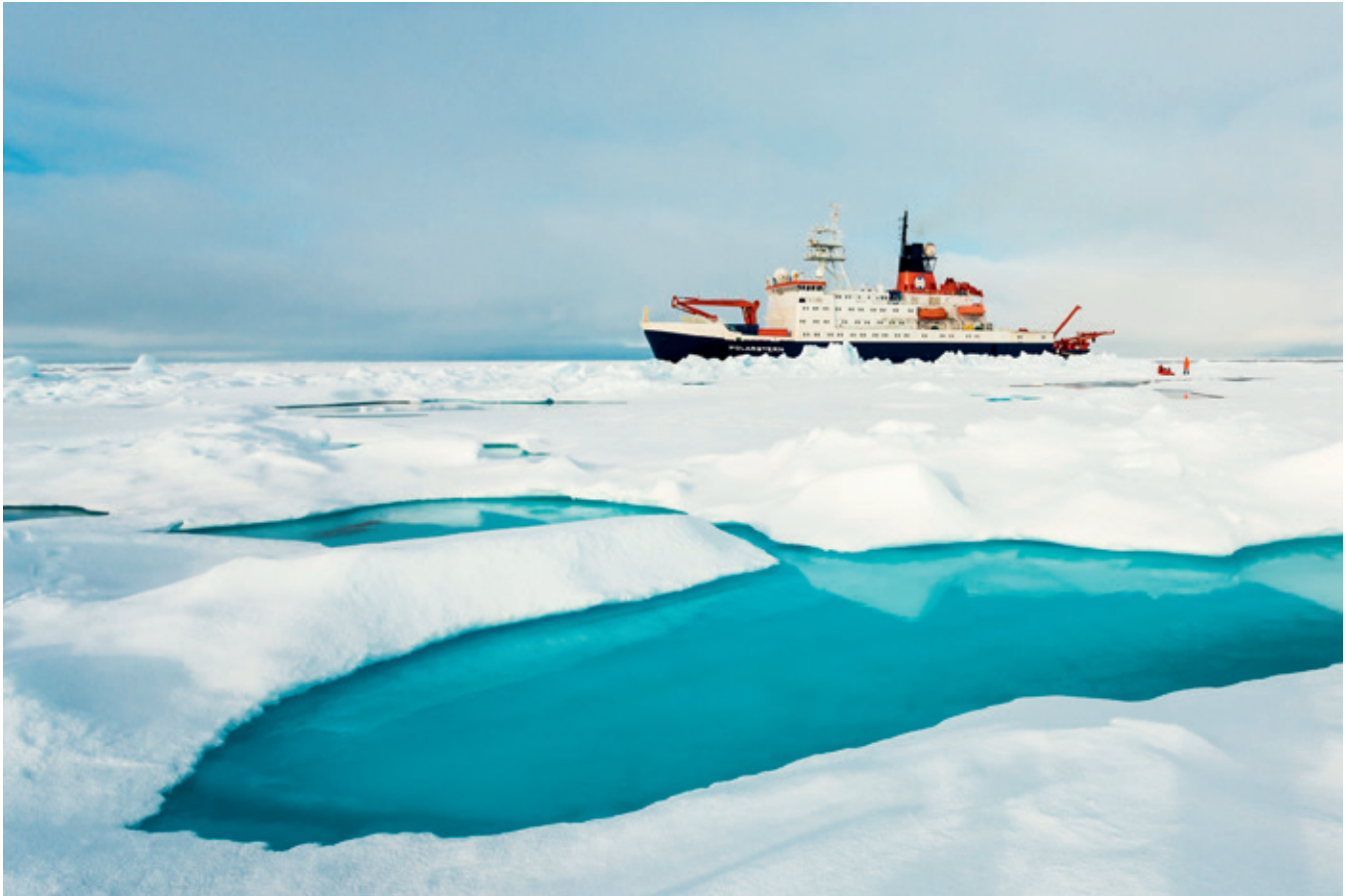
The German research vessel Polarstern has stopped next to a huge ice floe during one of its expeditions into the central Arctic. In the foreground one can see a melt pond, which has formed from melt water.