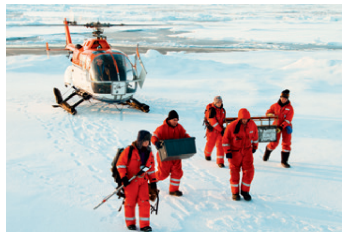
AWI sea ice physicists unload a Polarstern helicopter to investigate an Arctic ice floe and its snow cover.