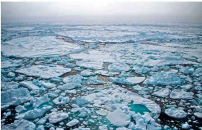
This photo shows young Arctic sea ice in the Northern Fram Strait. The ice floes had been formed during winter. On average they are 0.9 metre thick.

The extent and thickness of sea ice vary with the seasons. In austral winter, when an extensive sea ice cover spreads over the Southern Ocean (Antarctica),