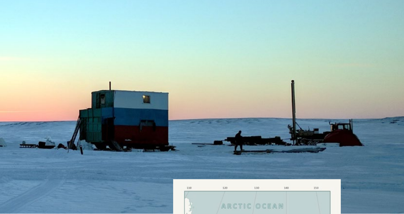
Figure 1: Sites where we drilled deep into the permafrost and unfrozen deposits to get deep insights into the past. Included sites are Bols'hoj Lyakhovskiy (Island (2014 N73.33, E141.32), Buor Khaya Peninsula (2012, N71.4203, E132.111), Bykovskiy Peninsula (2017, N71.7452, E129.3022), Kurungnakh Island (2015, N72.2903, E126.1843), Mamontovy Klyk (2005, N73.60597, E117.17736), Samoylov Island (2005 and 2018, N72.3766, E126.4816), Sardakh Island (1998, 2009 N72.571544, E127.241499), and Turakh Island (2005, N72.9740, E123.7986).