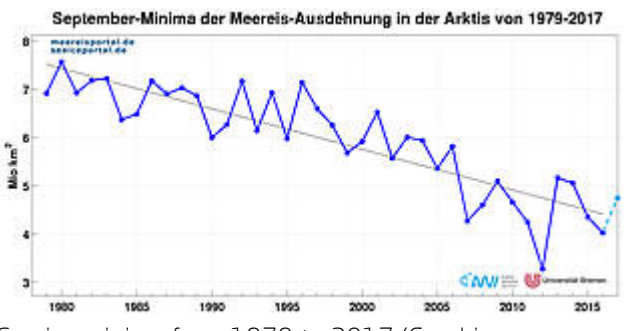
Sea ice minima from 1979 to 2017

The exact date and value of the minimum sea ice extent in 2017 can only be determined in the coming weeks, after a significant increase. The monthly mean of the September sea ice extent can then only be determined in October. It is expected to be roughly 5 million