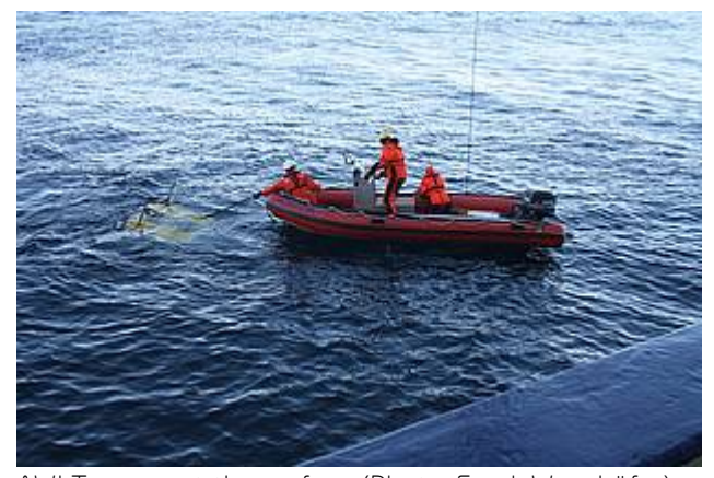
AWI Tramper at the surface

Once Tramper had been found, the researchers and engineers had to have a bit of patience before it could be brought to the surface. The robot can only be retrieved with the help of an inflatable boat – but, given the high winds (five to six on the Beaufort