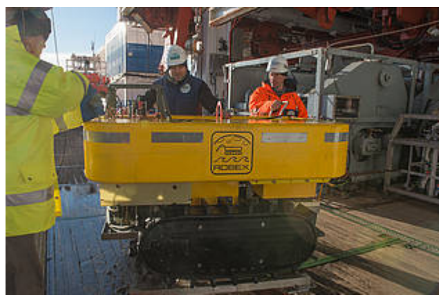
AWI underwater robot on deck RV Polarstern

An assessment of the data and a closer visual inspection confirmed that the measuring and recording systems (camera and sensors) had worked perfectly. "All of the programmed cycles (sleep - drive - sediment check - photo - measure - photo) worked as they were meant to - unfortunately, for the second half of the mission, only in one spot over and over," explains Wenzhöfer. Because of the broken tread, for weeks Tramper dug itself deeper and deeper into the seafloor. As a result, the robot covered a total distance of roughly 360 metres. "The first 24 weeks show some exciting data that we'll now begin carefully analysing. And that means we now know more about variations in oxygen consumption on the Arctic seafloor over half a year (July to December)," summarises Wenzhöfer. What's more, the robot's designers were amazed to see how much battery charge it still had - an aspect they had been somewhat concerned about. Since Tramper used up only half its charge, it could have kept going for almost another full year. Battery performance at 0.8 degrees below zero is difficult to predict, making this a welcome surprise.