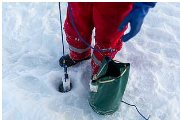
Taking Water Samples