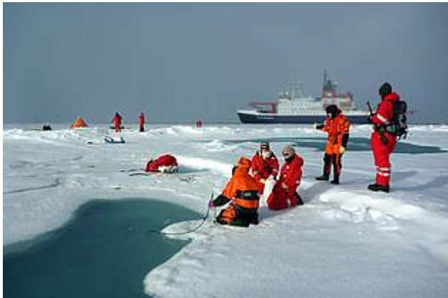
Ice Station

The samples from 2011 came from sea ice that had started its long journey north in the coastal waters of the Laptev Sea of eastern Siberia nearly two years earlier, in October 2009. The samples from 2015, which had only been underway in the Arctic Ocean half as long, showed a markedly lower level of the greenhouse gas. The analysis revealed that this ice was formed much farther out, in the deeper ocean waters. However, until now, the climate researchers' models haven't taken into consideration the interaction between methane, the Arctic Ocean and the ice floating on it.