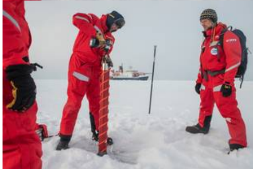
First group of scientists on ice floe

The researchers were unable to determine the floe's makeup using satellite imagery alone; it took several days and nights of intensive work on the floe itself to gather the requisite data for making a sound choice. In this