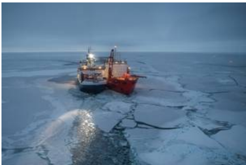
RV Polarstern and Akademik Fedorov

The die is cast: The MOSAIC team has now selected the floe that will serve as the base of operations for their one-year-long ice drift around the North Pole with the German research icebreaker Polarstern. This was preceded by an intensive search combining satellite imagery and helicopter flights over the target area in the Central Arctic, which were supported by the icebreaker Akademik Fedorov, operated by Russia's Arctic and Antarctic Research Institute (AARI). The participating researchers closely examined 16 floes that, on the basis of satellite imagery, were potentially large enough to accommodate the ice camp. They subsequently met on board Polarstern to compare their findings, ultimately agreeing that the ice drift should be prepared for on a floe measuring roughly 2.5 by 3.5 kilometres, and located at 85 degrees north and 137 degrees east. The floe, which Polarstern will allow herself to become frozen to, is currently drifting in alternating directions, at up to 10 kilometres per day.