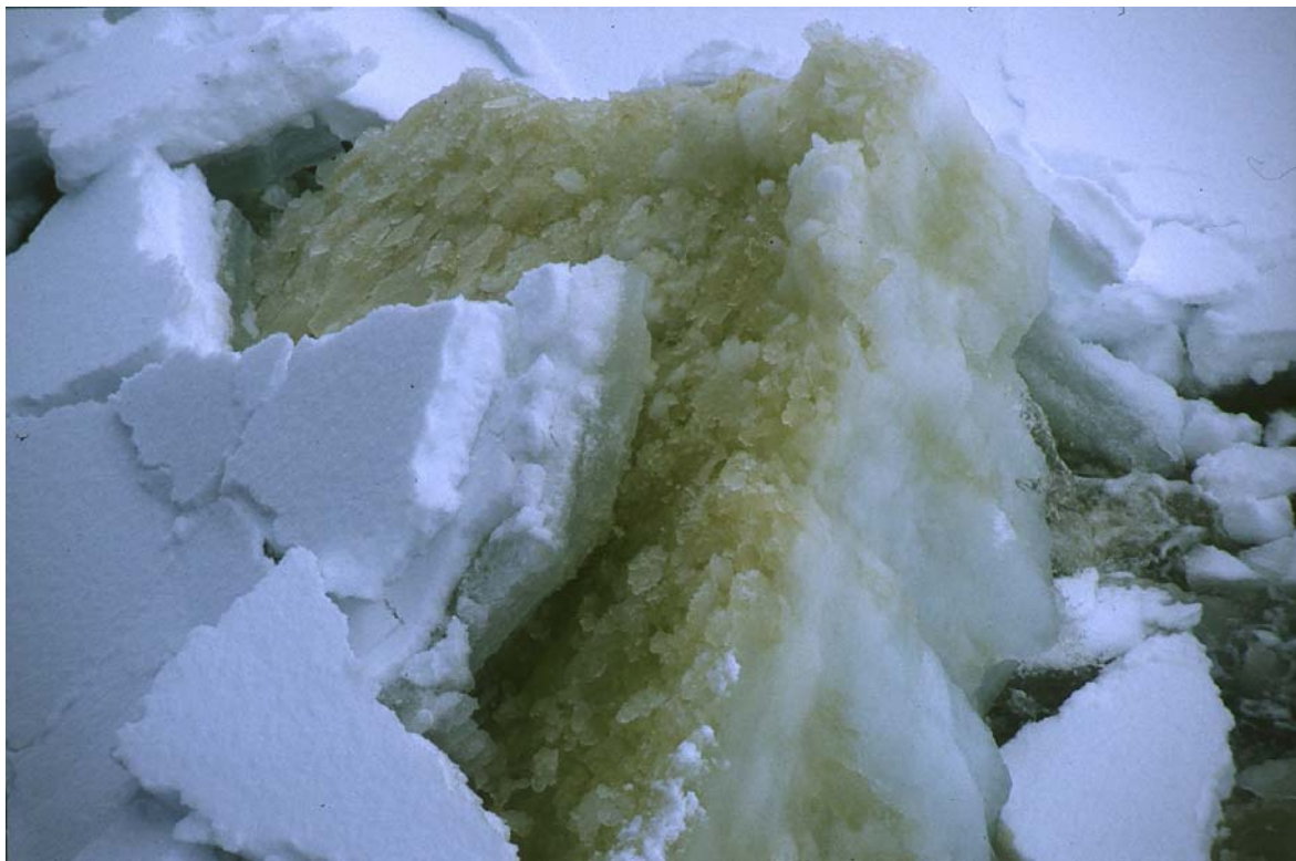
Figure 1: Small ice floe tilted during ice breaking. The ice is strongly inhabited by algae and shows the typical layering of porous summer sea ice.

The station floe fractured twice during the observation period, but with little consequences for the scientific program. Unfortunately, the long-term Polarstern schedule required a completion of the study in early January 2005. Therefore, we plan to repeat the project to cover the complete summer melting between January and March as part of a future Polarstern drift experiment.