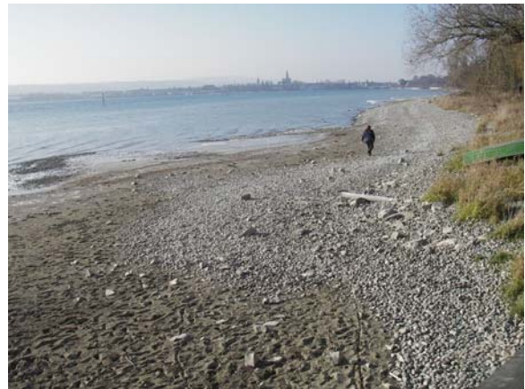
Fig. 2 The dry-fallen littoral near Konstanz, December 2005.

The following articles are an attempt to compile current knowledge on ecological effects of WLF in lakes. They span a wide range of geographic regions, morphological lake types and applied scientific disciplines. The publications presented here are the results of a workshop hosted by the collaborative research centre on lake littoral ecology at the University of Konstanz (SFB 454—Bodenseelitoral) in December 2005. Participants at this conference witnessed Lake Constance during an extreme drought of the lake which occurred that winter, exposing large parts of the littoral zone (Fig. 2) and causing dramatic reduction of the Dreissena mussel population in frost-exposed zones, which are an important food source for water fowl (Werner et al., 2005). The recently reported invasive clam Corbicula fluminea also