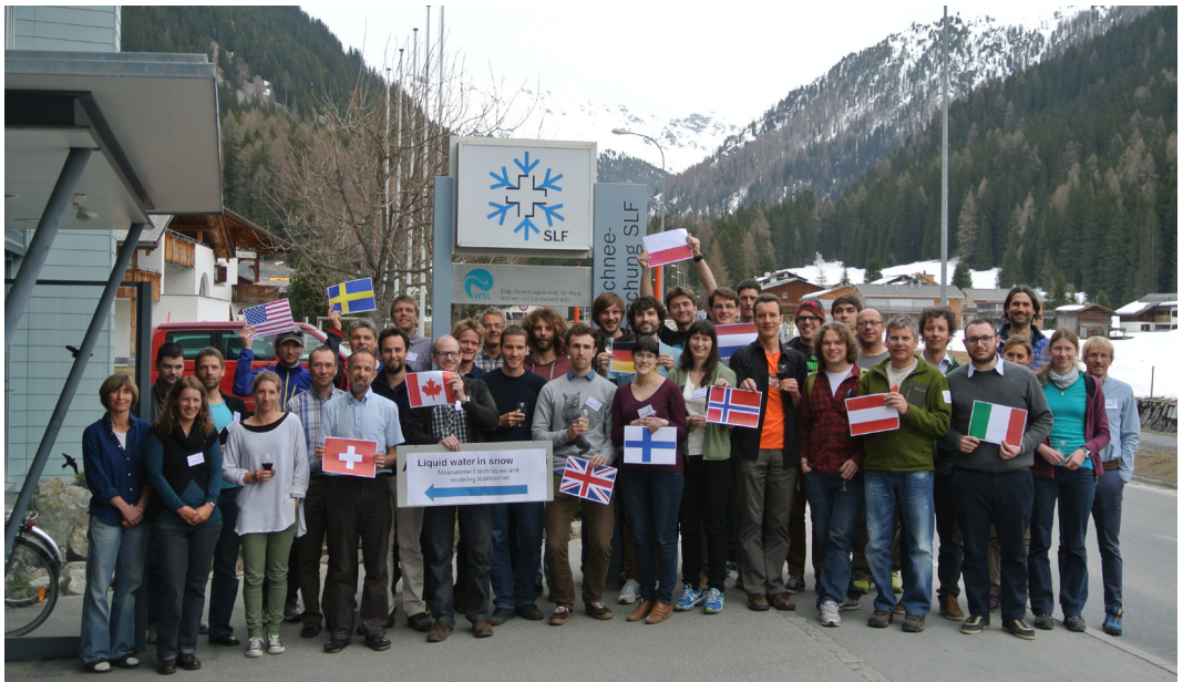
Group photo (A. Heilig)

Crowded snow pit: after initial surveys with GPR from the surface, two simultaneous sets of pit-wall profiling using several different methods were applied to get information on lateral continuity and reproducibility of water in snow over time (Photo: O. Eisen)