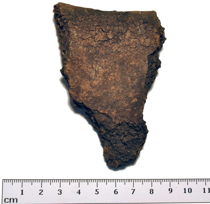
Fig. 3: Example of a pottery sherd of fired clay recovered from the Thule-era Neoeskimo site at Nunalleq, Alaska (for location see Fig. 1-6). Organic residues can be seen flaking away at the top of the sherd and indicated that the vessel had been used for processing of aquatic resources.

Abb. 3: Beispiel für eine Keramikscherbe aus gebranntem Ton geborgen aus der Thule-Ära Neoeskimo Stätte von Nunalleq, Alaska (Standort siehe Abb. 1-6). Organische Rückstände, die vom oberen Rand der Scherbe abplatzen, weisen darauf hin, dass der Behälter für die Verarbeitung von aquatischen Ressourcen verwendet wurde.