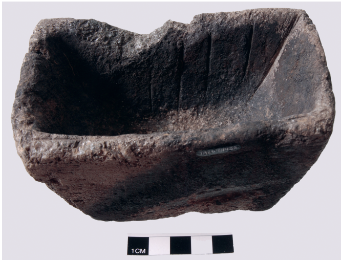
Fig. 4: Example of a complete Dorset Palaeoeskimo soapstone vessel recovered from Port au Choix archaeological site, Newfoundland.

Abb. 4: Beispiel für einen vollständigen Specksteinbehälter der Dorset Palaeoeskimo geborgen aus der archäologischen Ausgrabung von Port au Choix, Neufundland.