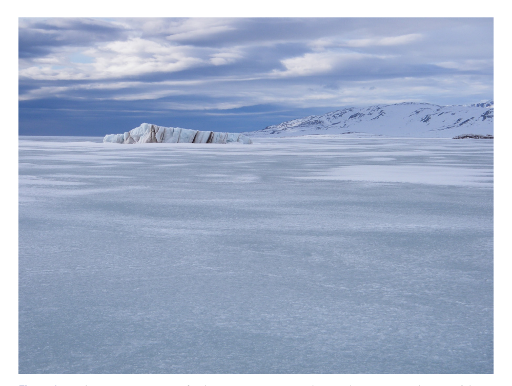
Figure 1: Landfast sea ice in Kongsfjorden in spring 2009, with an iceberg in some distance.

Landfast sea ice covers the inner parts of Kongsfjorden, Svalbard, for a limited time in winter and spring months, being an important feature for the physical and biological fjord systems (Figure 1). Systematic fast-ice monitoring for Kongsfjorden, as a part of a long-term project at the Norwegian Polar Institute (NPI) was started in 2003, with some more sporadic observations from 1997 to 2002. It includes the ice extent mapping and in situ measurements of ice and snow thickness, and freeboard at several sites in the fjord. The permanent presence of NPI personnel in Ny-Ålesund Research Station enables regular in situ fast-ice thickness measurements as long as the fast ice is accessible. Further, daily visits to the observatory on the mountain Zeppelinfjellet close to Ny-Ålesund, allow regular ice extent observations (weather, visibility, and daylight permitting). Data collected within this standardized monitoring programme have contributed to a number of studies. Monitoring of the sea-ice conditions in Kongsfjorden can be used to demonstrate and investigate phenomena related to climate change in the Arctic.