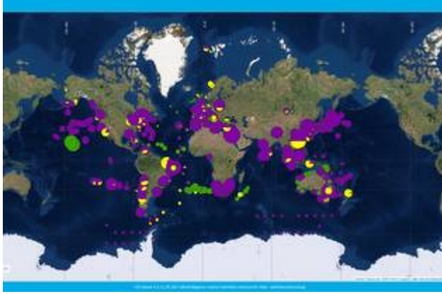
Research on Marine Litter

According to Bergmann, "The maps document where researchers have identified litter. But it's important to bear in mind that the blank areas of the map don't necessarily represent clean regions; instead they're blind spots." This information, too, is extremely valuable and helps