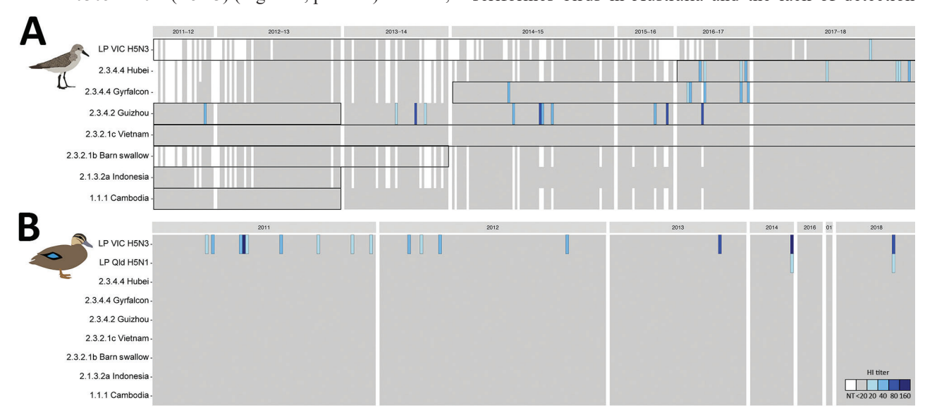
Figure 2. Avian influenza H5 virus hemagglutinin inhibition (HI) antibody patterns, Australia, 2011–2018. A) For red-necked stint, year represents the austral summer period, October–April, when this species has a migratory nonbreeding stopover in Australia. Boxes represent periods of circulation for each strain's lineage, as determined by genomic sequences (Appendix Table 4, https://wwwnc.cdc.gov/EID/article/25/10/19-0699-App1.pdf). B) For Pacific black duck, year represents calendar year. White indicates untested serum samples; gray indicates a titer <20, the starting titer for this assay; blue indicates hemagglutinin inhibition (HI) antibodies, and shades vary depending on HI titer (20–160). Sample numbers are ordered by collection year and sequentially from left to right in the order in which individual birds were caught. Antigens used in this study are on the y-axis, and abbreviated with relevant clade information; full strain names are available in the Table. NT, no titer. Greater detail on positive samples appears in Appendix Figure 1.

Despite intercontinental spread of gs/GD lineage HPAI H5Nx viruses from Asia to Europe, Africa, and North America, we have no evidence that incursions of these viruses have occurred in Australia. A leading hypothesis for the lack of incursion is the absence of Anseriformes birds migrating between Asia and Australia (23,29). However, millions of shorebirds that are reservoirs for AIV migrate from Siberia to Australia, with stopover sites along the coast of East Asia (15–17,29). We demonstrated that these intercontinental migratory birds have been exposed to gs/GD lineage HPAI H5Nx viruses and have the potential to bring these viruses into Australia. The absence of HI antibodies against gs/GD lineage HPAI H5Nx viruses in a widespread and abundant Anseriformes birds in Australia and the lack of detection