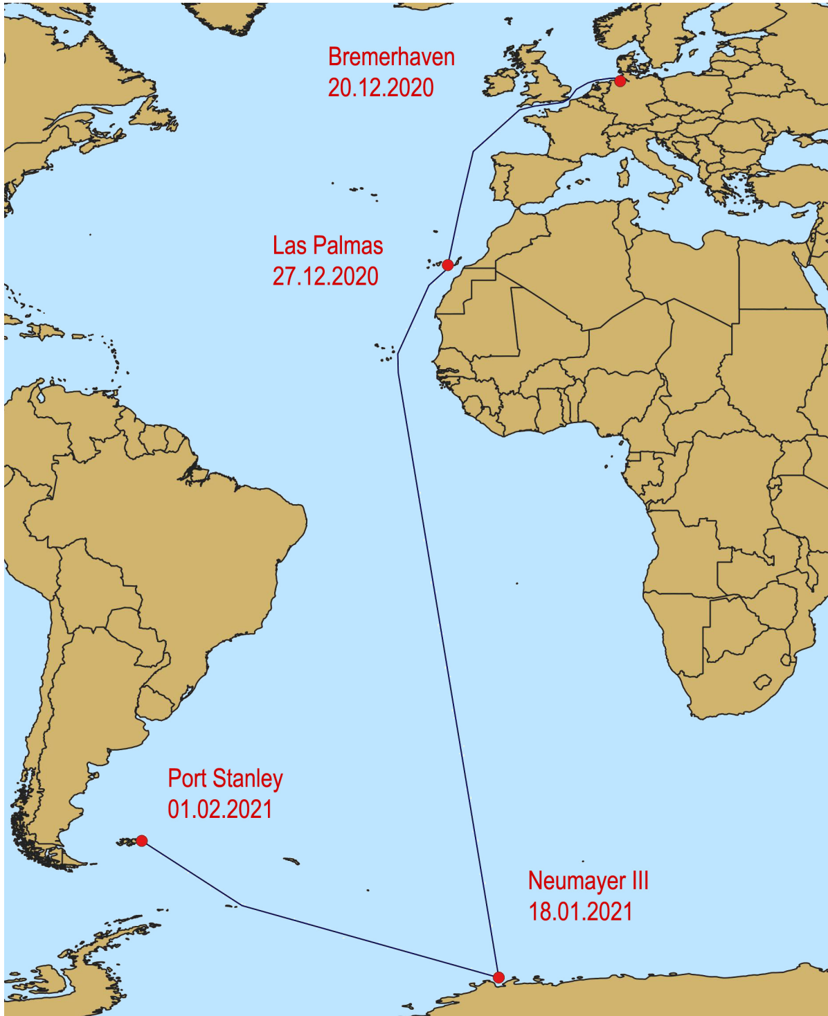
Abb. 1: geplante Fahrtroute Expedition PS123 Fig. 1: planned course for expedition PS123