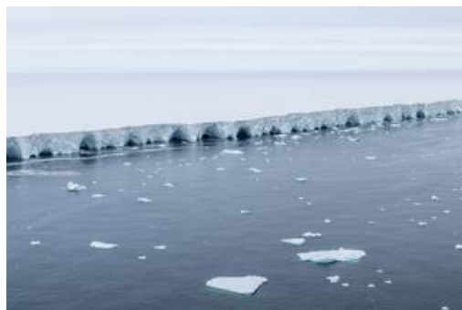
Pine Island Glacier

At the moment, those glaciers that empty into the Amundsen Sea are losing ice faster than all other ice streams in the Antarctic or in Greenland. Moreover, ice sheet simulations and sediment samples from