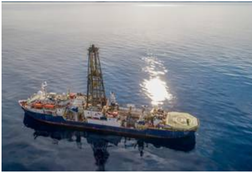
The IODP drilling ship JOIDES Resolution

The participants in the second expedition (IODP 382), which will take them to the Scotia Sea from 20 March to 20 May, will rely on the same research principle. The waters between the Antarctic Peninsula and the Falkland Islands are considered both the main route for large